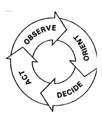
Figure 2: The OODA Loop<sup>46</sup>

There are two goals associated with the OODA loop: rapid action and effective action. If the action taken is ineffective, then the effort and time spent was wasted. The speed of action allows for the exploitation of opportunity. The quicker the process is completed, the greater the potential for opportunities.